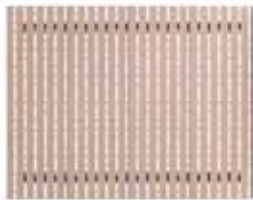
Two or more Titan Deck boards make a panel assemble.